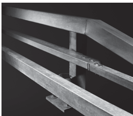
H4a unclad parapet transition