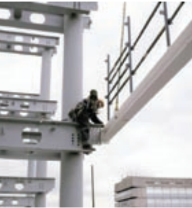
Installing the steelwork for the cantilever over Blackfriars Road