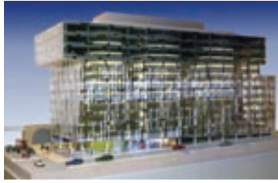
Palestra's dramatic overhangs reflect the reality of commercial office rents